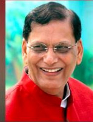
Dr. Bindeshwar Pathak

Founder, Sulabh International Social Service Organisation, India